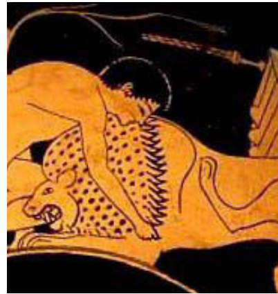
Herakles wrestling the lion.